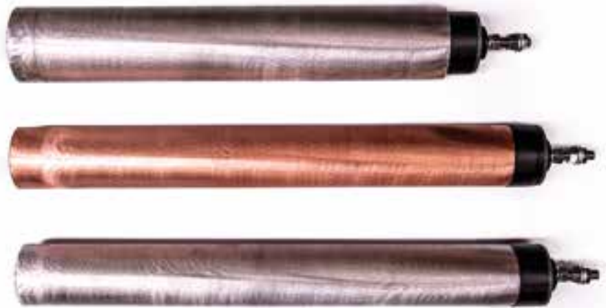
Fig.2 Anodes WWS CUPROLINE®, WWS ALOLINE® & WWS FERROLINE®.