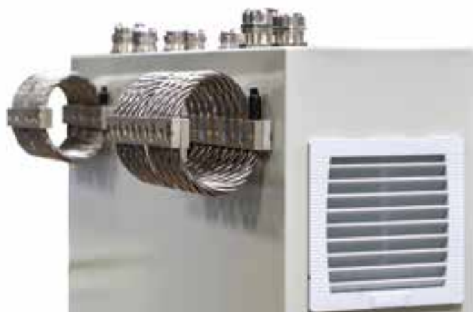
Silentblocks installed on Praicomatic® v5 12V/40A

The CPU PRAICOMATIC® v5 System is specifically designed to meet the stringent requirements of EMC/EFI, shock, vibration, low maintenance and flexibility of operation in the military environment.