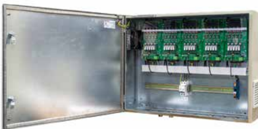
CPU Praicomatic® v5 12V/40A & 20 anodes